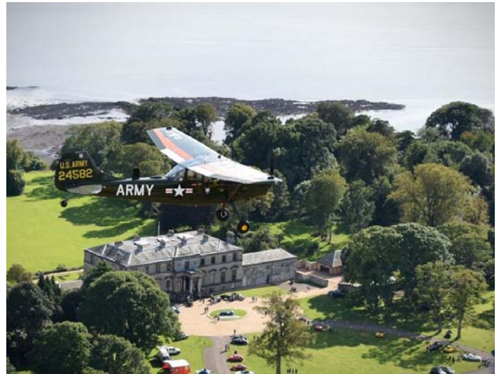
Vintage aircraft flies high over Broomhall House

essential work. They're already looking forward to this year's event, which will coincide with the 80th Anniversary of the Battle of Britain in September.