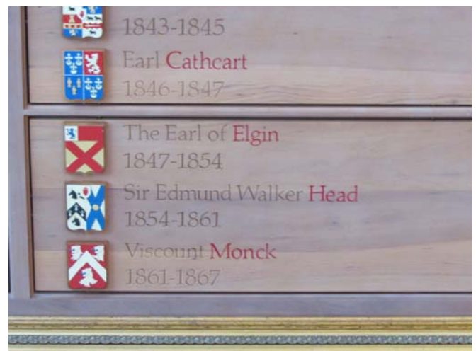
Armorial Shields featured at Rideau Hall