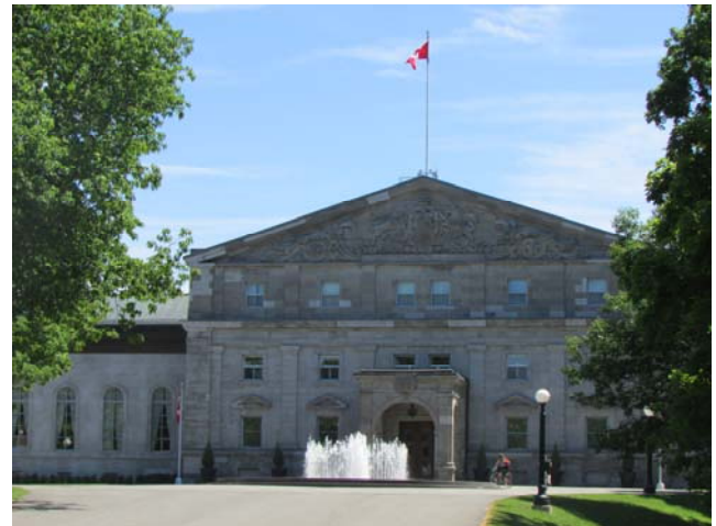
Rideau Hall – the official residence of the Governor General of Canada