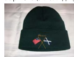
Black or Forest Green Bruce or Scotland