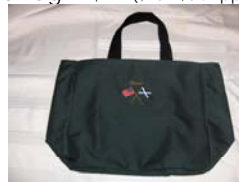
Forest Green Bruce Only

Tote Bag – $21 ($18 +$3 shipping) Cap - $18 ($15+$3 shipping)