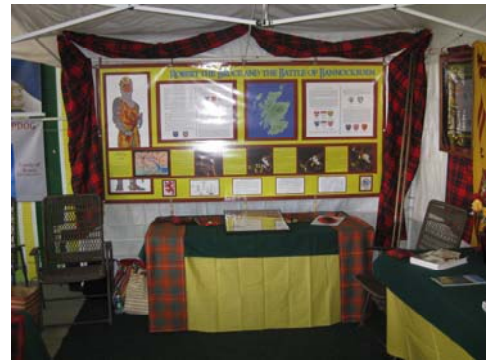
Here is the Bruce space all ready for the visitors!

We were up at six AM, quickly dressed in our tartans, got the dogs squared away (they will be in the house with the AC on all day, and will have a visit for watering, treats, and exercise mid day), iced the cooler with the bottled water, loaded up and headed for the fair grounds. We arrived about 8:15 and started to get the display tables covered and the display items set out. Don & Kathy soon arrived, and so did the Minnesota Sheltie Rescue people and dogs. They set up right next to us (as I have mentioned – we sponsor their participation). The gates open to the public at nine and we are all ready to engage.